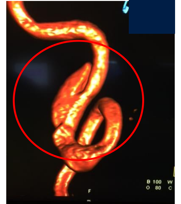
Pseudoaneurysm - Pre